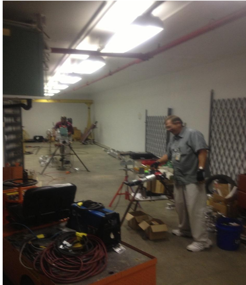
Vacuum Pipe Fabrication