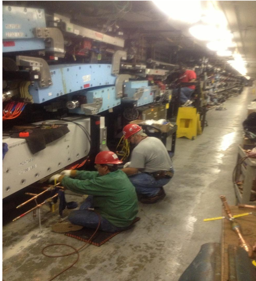
LCW at 1S