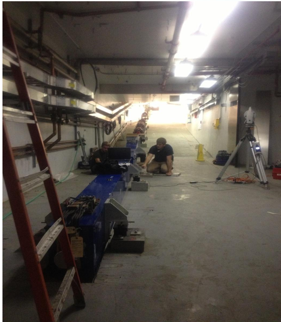
Dipole Alignment in 5C